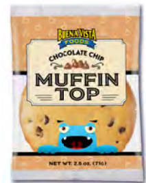
Sweet Potato Chocolate Chip