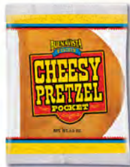
Cheesy Pretzel Pocket