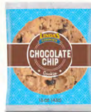
Chocolate Chip Extended Shelf-Life