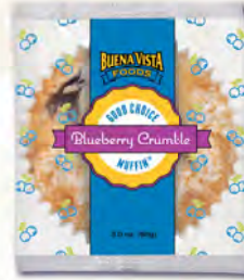
Blueberry Crumble Muffin