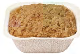
Coffee Cake and Topping Mix