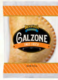
Three Cheese Calzone