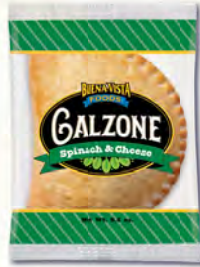
Spinach and Cheese Calzone

Tip: Make your budget go farther by utilizing your commodity dollars towards proteins for savory lunch entrées. Check out our commodity calculator at bvfoods.com