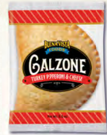
Turkey Pepperoni & Cheese Calzone