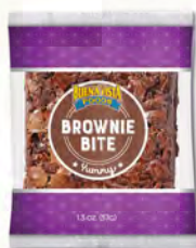
Fudge Brownie Bite