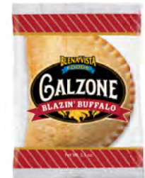
Blazin Buffalo Calzone