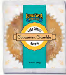
Cinnamon Crumble Muffin