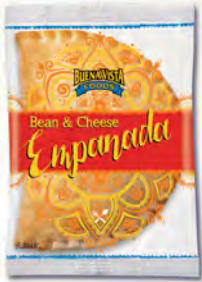
Bean and Cheese Empanada