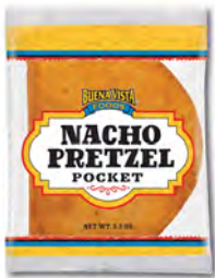
Nacho Pretzel Pocket