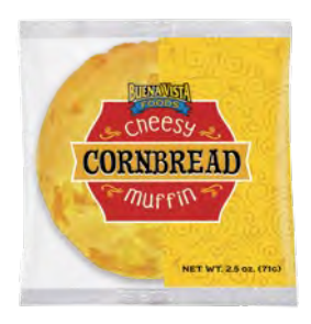
Cheesy Cornbread Muffin IW: 60521